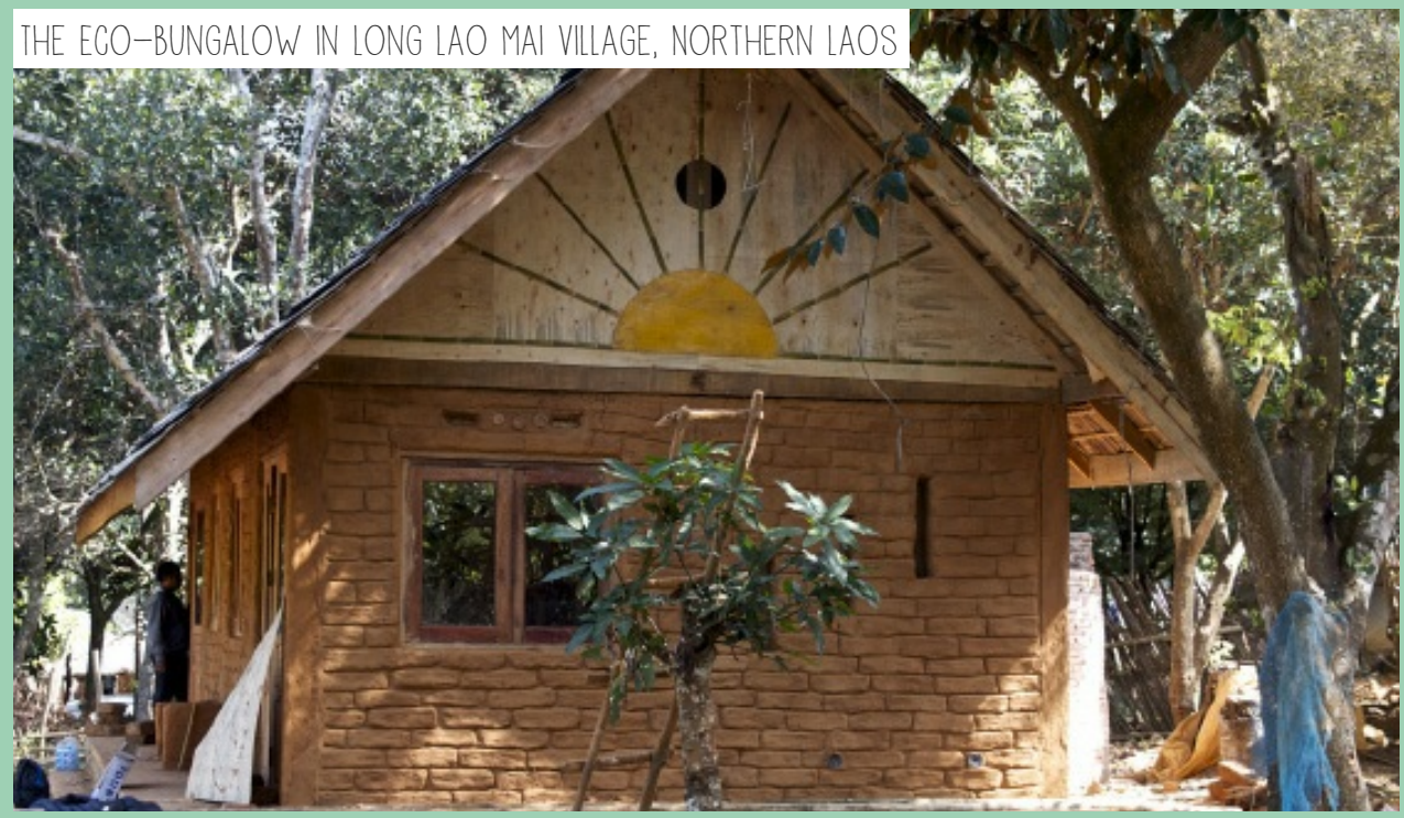
THE ECO-BUNGALOW IN LONG LAO MAI VILLAGE, NORTHERN LAOS

Laos is receiving increasing numbers of tourists each year. Large portions of the visitors are interested in the traditional Asian culture. Eco-tourism agencies are expanding their operations in to Laos but they rarely understand or cooperate with the most vulnerable ethnic minority communities, often due to a lack of suitable lodging facilities for the visitors.