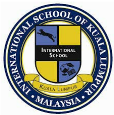
International School of Kuala Lumpur, Malaysia