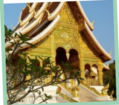
WAT HO PHA BANG TEMPLE, LUANG PRABANG

Let the work begin! The day begins with a yoga class as the sun comes up before breakfast. This is a great way to start the day. Breakfast is served around 7.30am. After breakfast we meet at the project site where we're divided into working groups that rotate at the various working stations as the day progresses. We have a fruit break around 10am and have a two hour lunch break at 12. We get back to the site again around 2pm and work through until 5. Evening activities vary but usually include playing cards, discussing the day around a bonfire and interacting with the villagers.